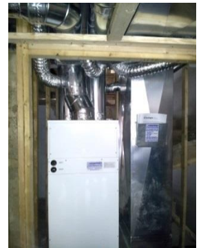
Zoned air handler installation

This case study resulted from the expanded LEEP pilot that took place in four Ontario regions during 2011 and 2012.