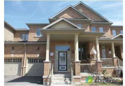
Arista Homes Townhome

Questions and Answers with CanmetENERGY on efficient Forced Air Zoning.