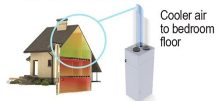
Figure 2: Cooling can be dedicated mainly to upper bedroom floor